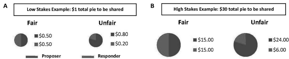
Figure 1. Participants respond to fair and unfair offers of high or low stake size in Ultimatum Game. If the responder accepts, portions are distributed as proposed; otherwise, neither party receives any payment. For example, A) if proposer offers $0.20 out of $1.00 and the responder accepts, both parties receive the proposed amounts, B) if $6.00 out of $30.00 is offered and the responder rejects, neither party receives any amount.

We tested the hypotheses that (a) more unfair offers will be rejected by the suicidal group versus other older adults in our sample; (b) as the stake size increases, the number of rejections of unfair offers will decrease in all groups but the suicide attempters. Suicidal behavior is heterogeneous, ranging from low-lethality